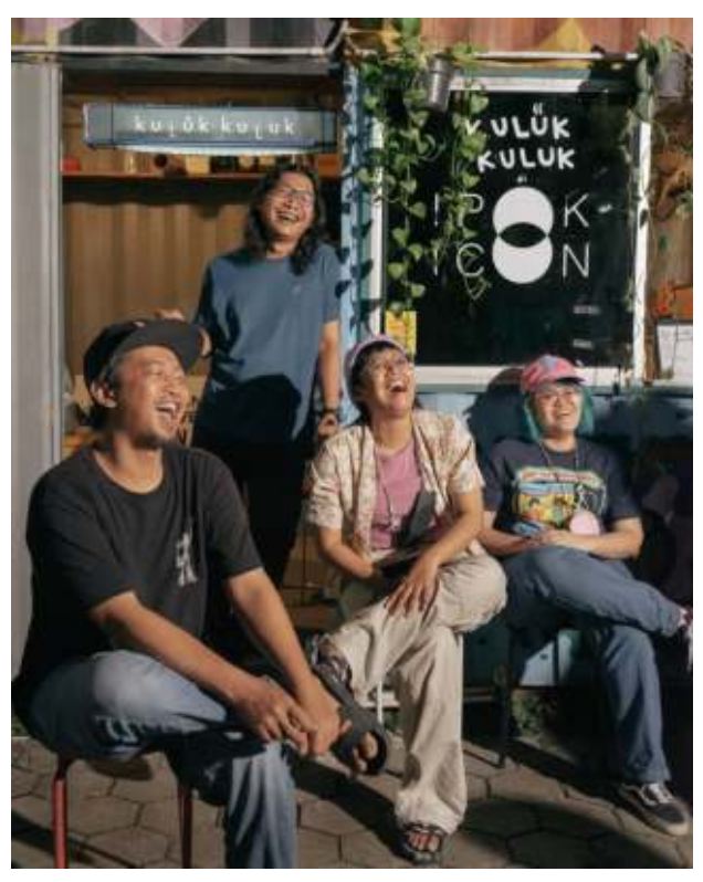
Community members engaged in "nongkrong" (the Indonesian term for hanging out) by the coffee shop at Gudskul.