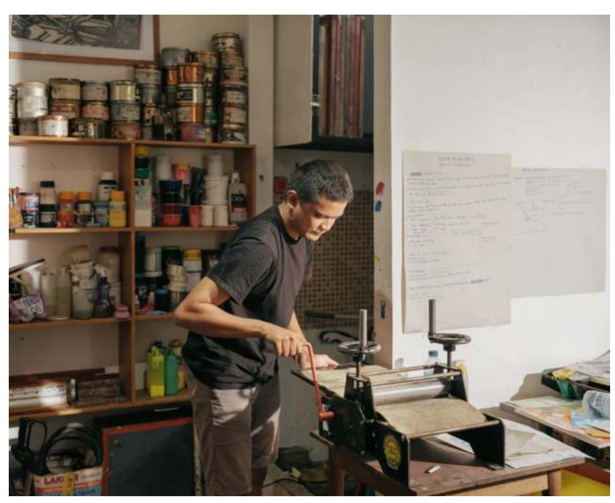
The printmaking studio at Gudskul, in Jakarta.

The first ruruhouse , circa 2000, was small: barely 700 square feet over two floors. A few of Ruangrupa's founders lived there, by way of paying themselves. The ruruhouses frequently hosted shows by other artists. Supartono recounted a striking one, in which untrained photographers displayed images of their homes: old photos, new photos, group portraits of the neighbors, all slipped into the sleeves of cheap plastic Kodak or Fuji albums from a photo lab. Supartono recalled some enraged visitors asking: "What the hell is this? Where is the quality of the photograph? Where is the frame?" But the photos were meant to make you think about what constitutes a good photo, about how photography works "as a cultural practice of everybody — of your mom or your neighbor."