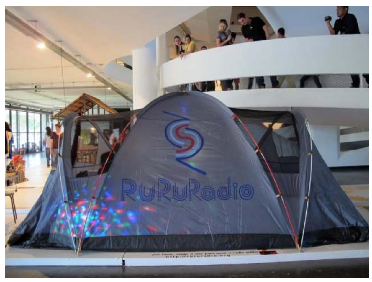
A rururadio stand-in at the 31st Bienal de Sao Paulo, Brazil in 2014 ruangrupa

Until 2017, Documenta hadn't paid artists for their work, assuming that their star would rise amply just by showing at Kassel. (It was strange, Saltz wrote in New York magazine, that Documenta's artists and curators assumed an "endlessly idiotic 'anti-market' stance" when the market was so tightly braided into the exhibition. This was still, he argued, "art only for the .01 percent.") Ruangrupa insisted on higher artist fees this year, running to tens of thousands of euros, but in addition, the mini-majelises were each given a pot of as much as 220,000 euros to spend as they wished. The artists agreed that their mini-majelises' pots would fund a printing press at Documenta, to publish daily bulletins and schedules. Separately, a share of Documenta's ticket sales sponsored a small arts festival in a Sumatran village. This level of autonomy felt riotous and profuse, like vegetation in an Amazonian jungle. Often I thought that ruangrupa couldn't possibly know about every single thing blooming on its watch.