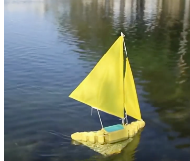
changing shape of the sailing boat → while turning wind from both sides = more speed and pulling power

With a new design of a boat (long tradition of sailing) new possibility of using wind power and sea power to redone man made problems.